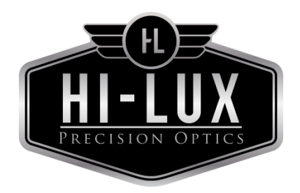
We Lead the Way